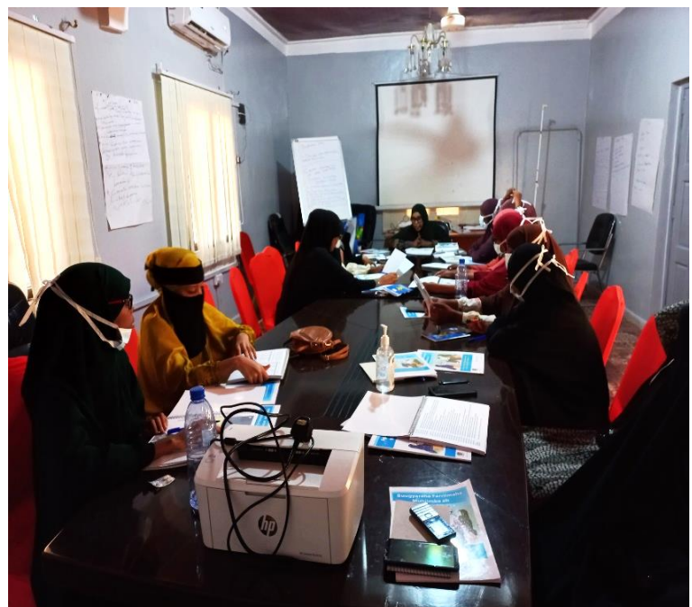
Figure 3: Facilitator is giving a session to the participants