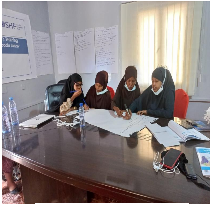
Figure 1: Group discussion