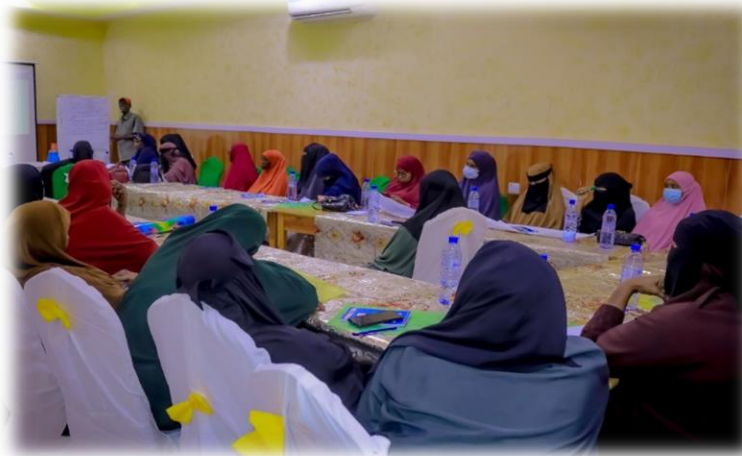
Group discussions are taking place among participants.